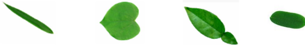
Figure 1. Sample leaf

In this research the data used in the form of a leaf image with a white background. The dataset used is a green leaf image consisting of 5 types (5 classes). Image data used 100 image. Leaf image classification system using K-Nearest Neighbor method consists of several processes including pre-processing, feature extraction and classification stage. The sample data used as shown in Figure 1.