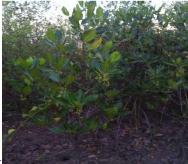
Figure 1:- Mangroves