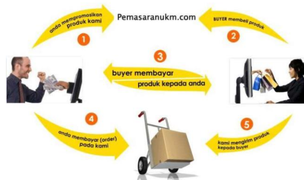
Figure 3. Low of pemasaranukm.com.

comparing your business with other things. Do not hesitate on something that is concise, solid and clear because 1-2 sentences will be very effective.